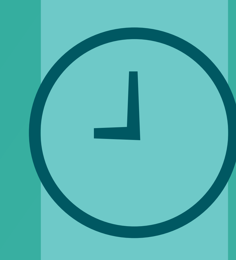
Subtle signs are present 6-8 hours before a critical event