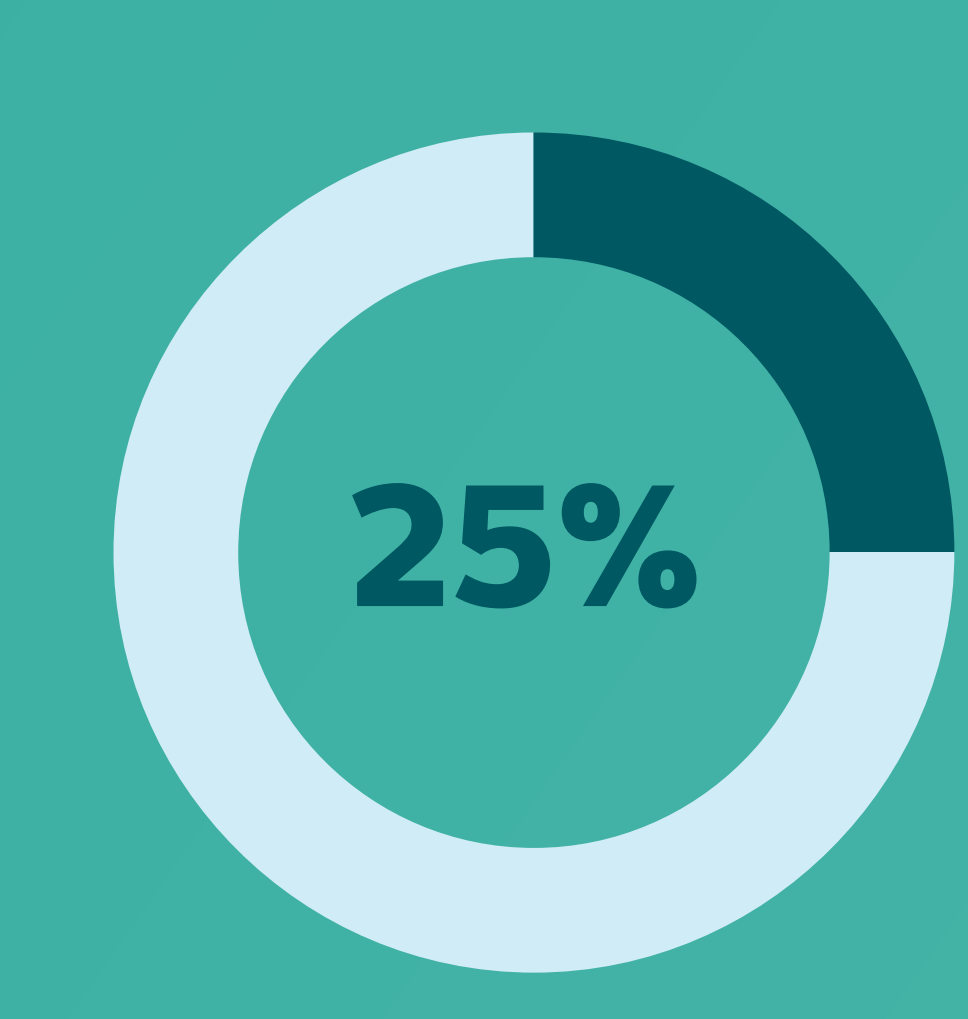
A doctor is notified only 25% of the time